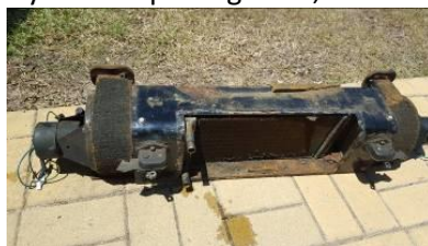
Just to remind you (and me!) what it looked like to start with.