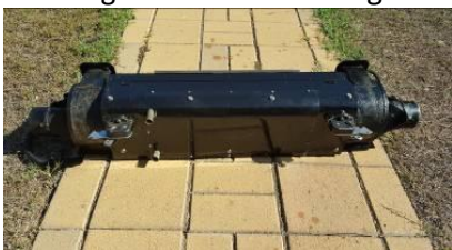
The finished heater box ready for re-fitting.

The heater box has now been rebuilt and re-fitted to the bulkhead, after some serious cleaning! The insulating covers look their age and may need replacing soon, but where do you stop?