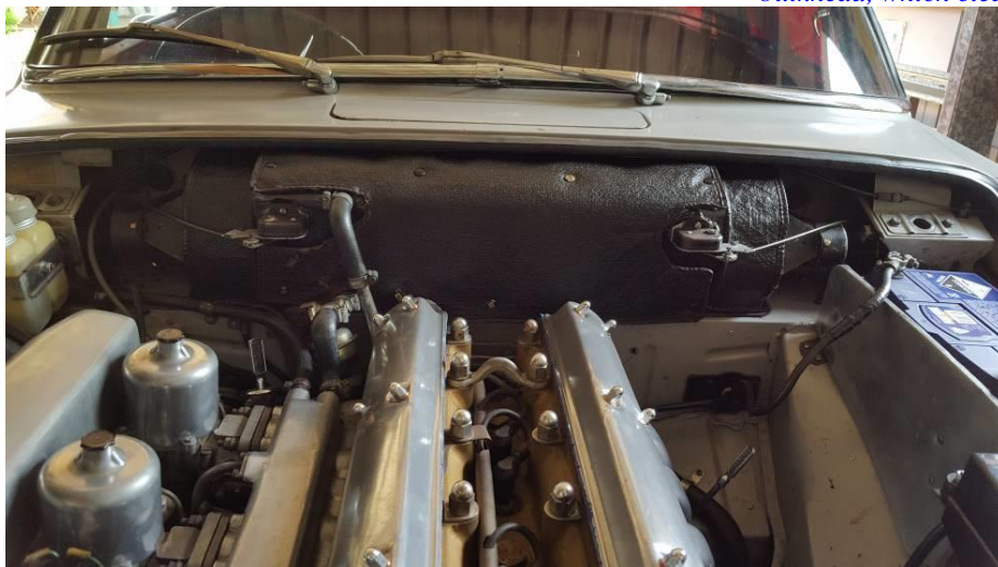
The finished heater assembly - waiting for the first snows in Townsville.....